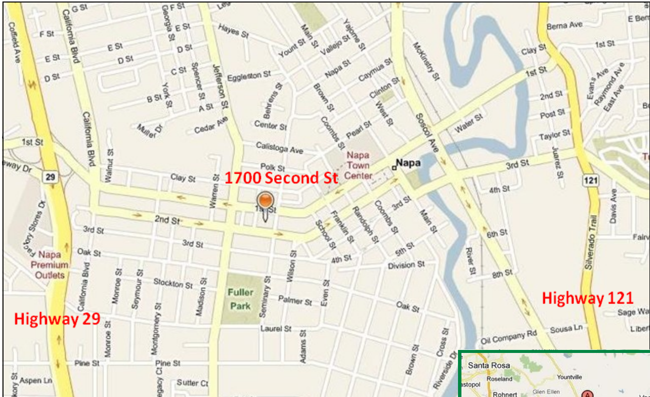
Prime location in Napa with easy access from Highways 121 & 29